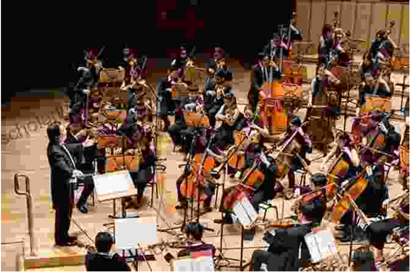
An orchestra performing the Concerto in F Major