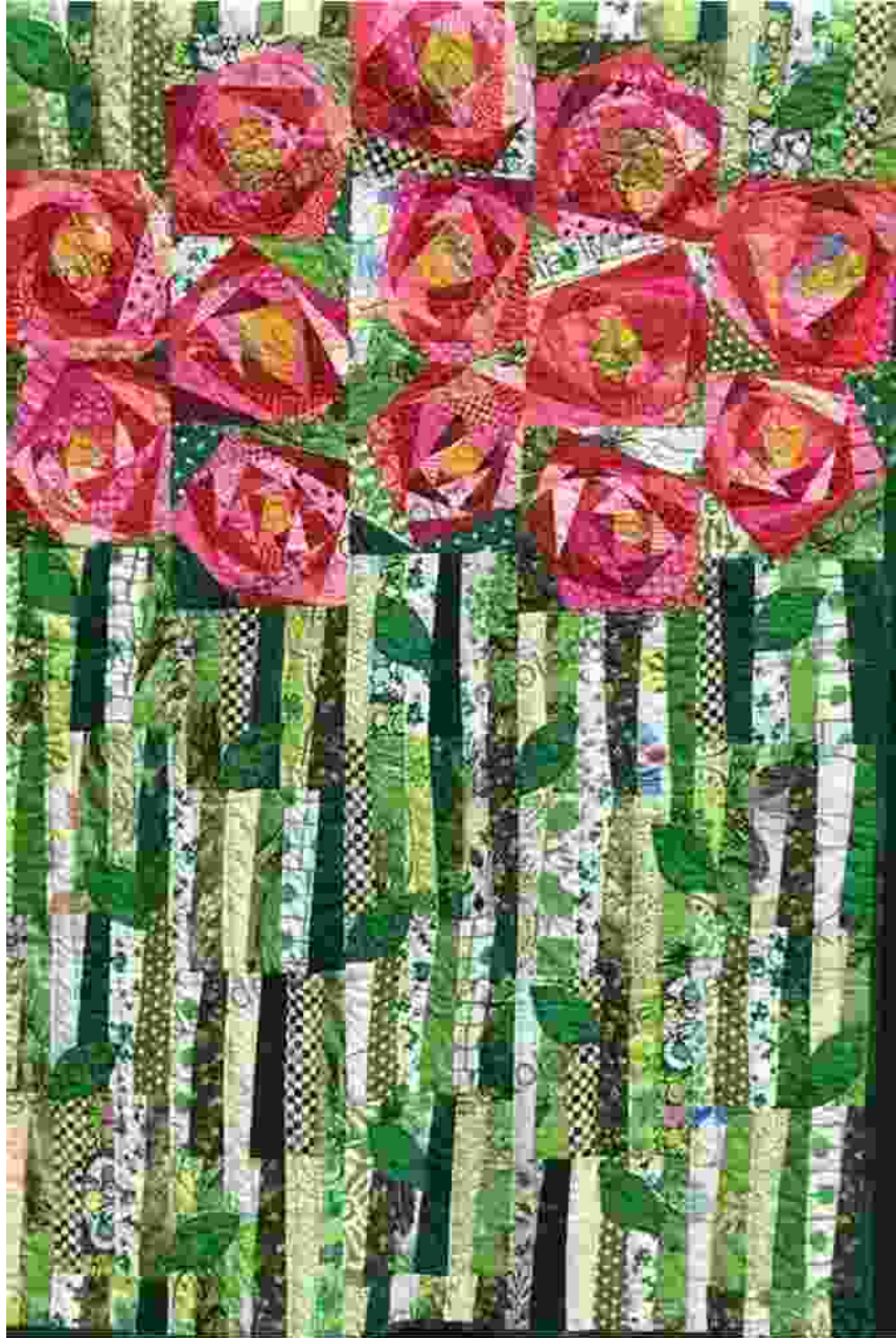
Modern quilt with an abstract floral design using geometric shapes