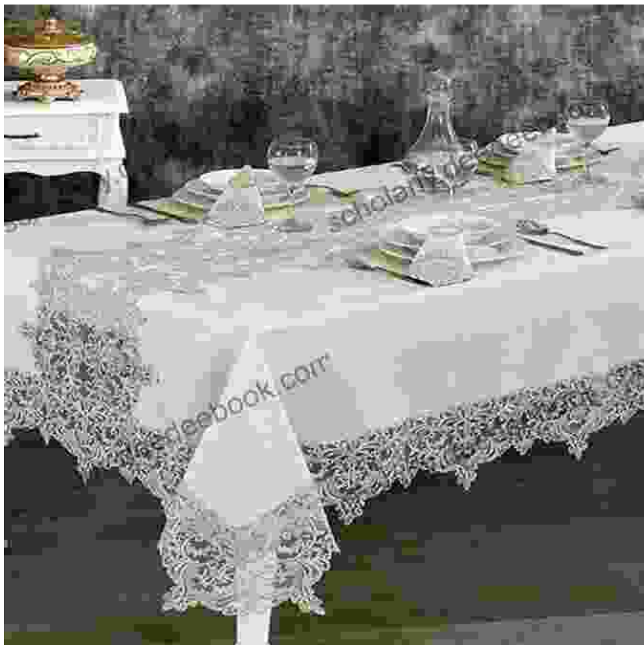
Floral embroidery on a lace tablecloth