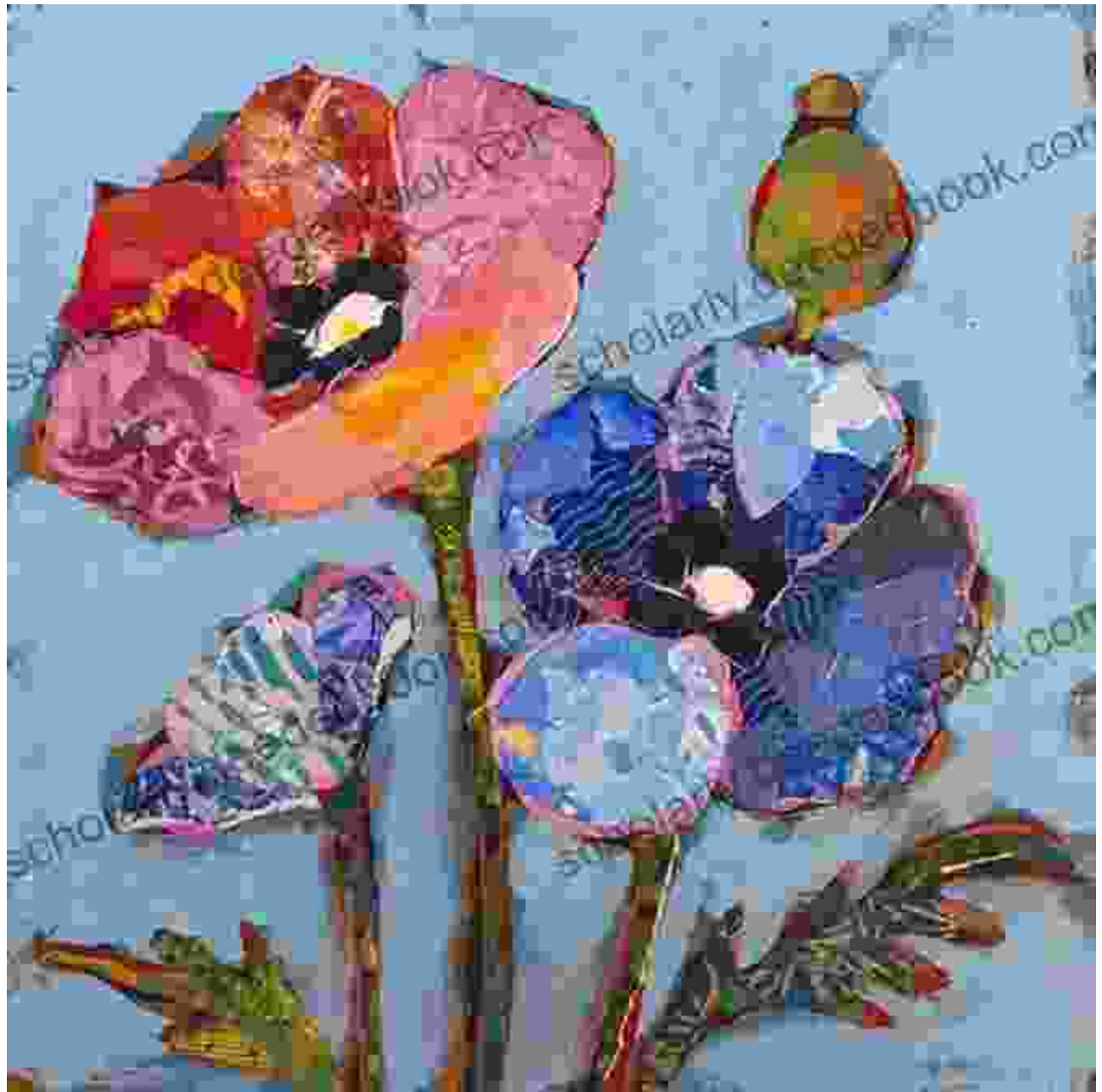
Mixed media artwork featuring a floral collage on a wooden panel