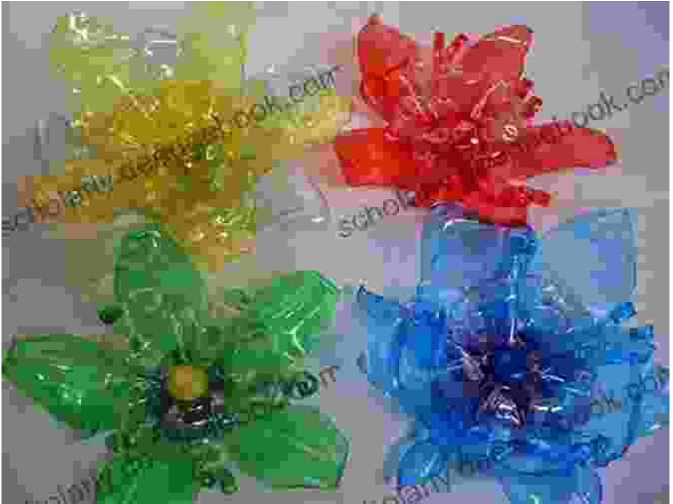
Mixed media artwork featuring a floral design made from recycled materials