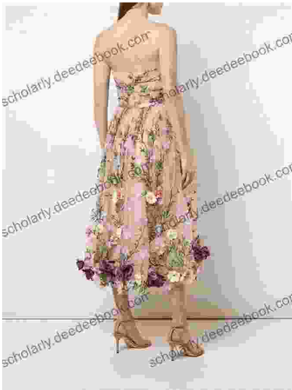
Floral embroidery on a silk dress

French knots, each stitch contributes to the overall beauty of the floral design. Embroidered flowers can be found on everything from garments and accessories to home decor, adding a touch of elegance and sophistication to any piece.