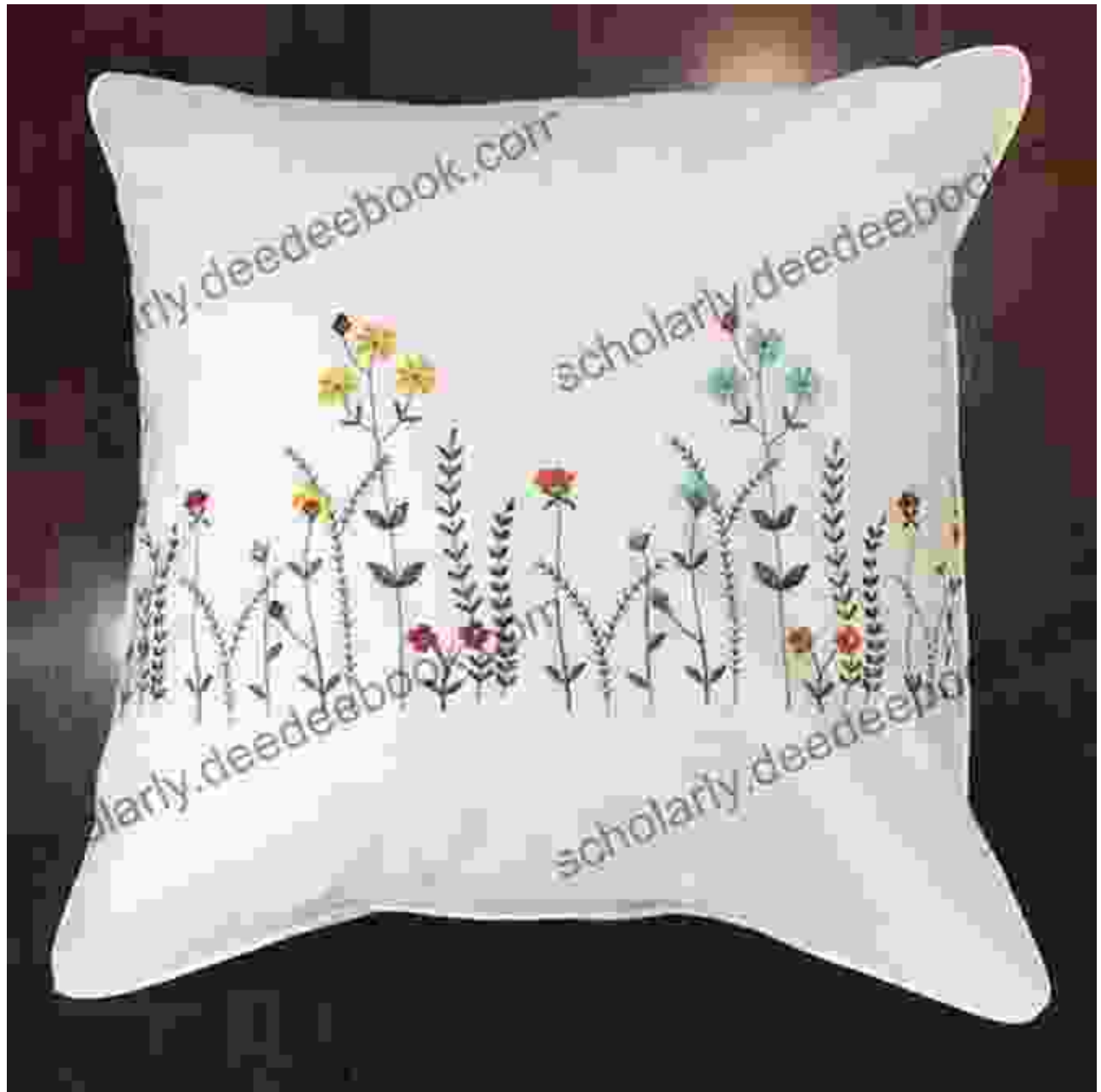
Floral embroidery on a linen cushion