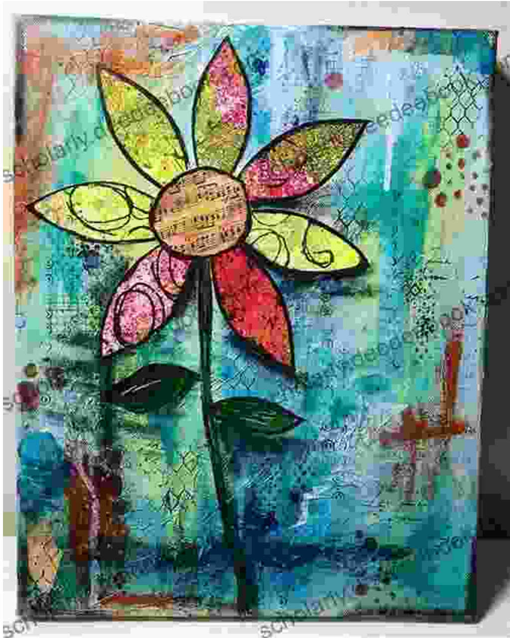
Mixed media artwork featuring a floral design on a canvas

painting, photography, and collage. By blending different materials and techniques, artists are able to push the boundaries of artistic expression and create truly one-of-a-kind pieces.