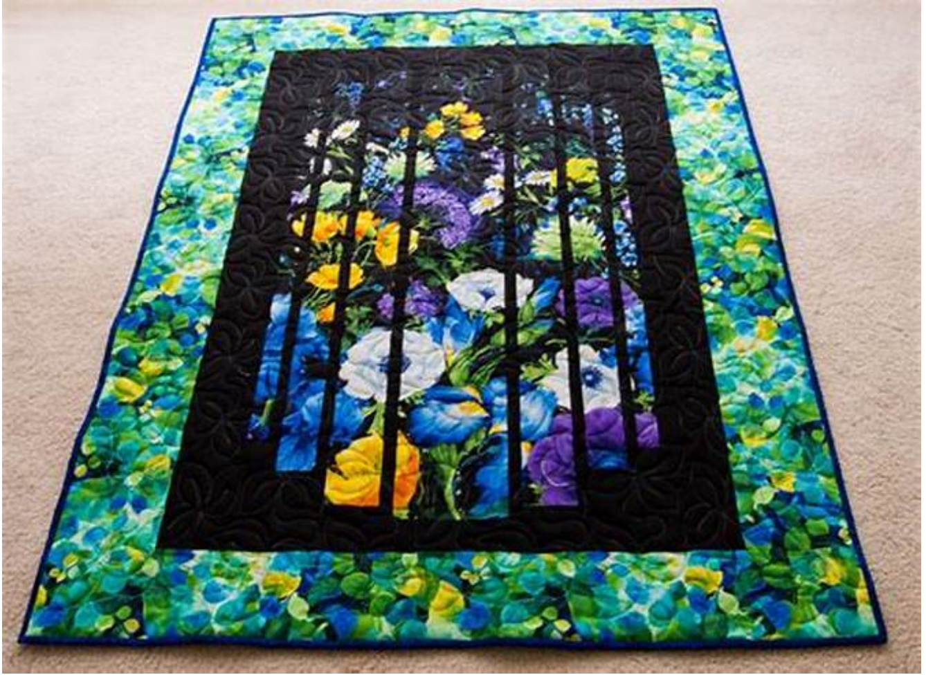
Appliqué quilt with a delicate floral design and intricate details