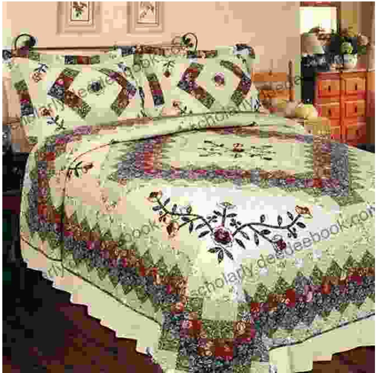
Traditional patchwork quilt with a colorful floral design