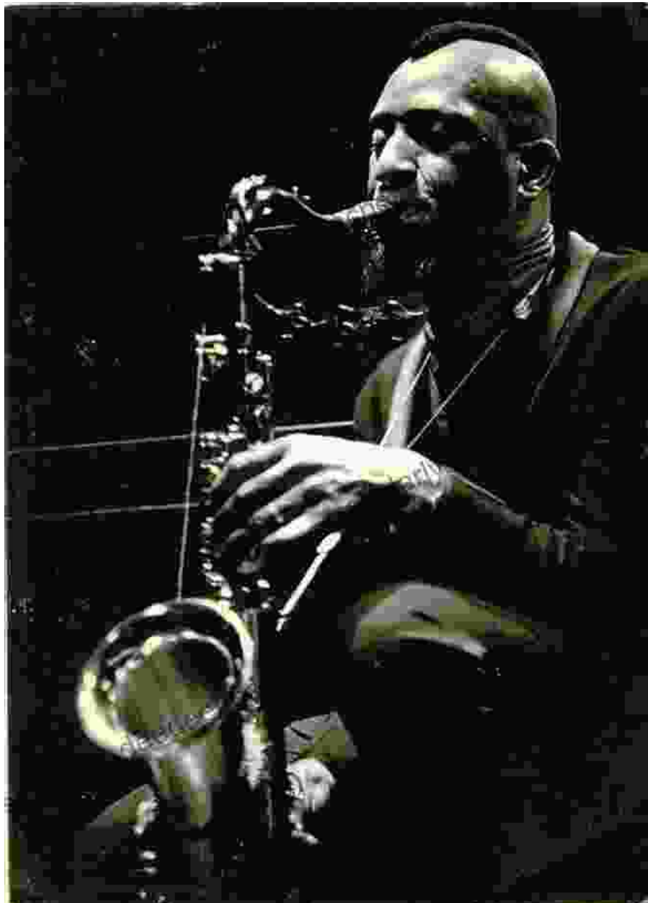
Rollins's Harmonic Style

Rollins's melodic style is characterized by its long, flowing lines. He often uses chromaticism, scalar runs, and arpeggios to create a sense of movement and tension. Rollins also has a keen ear for harmony, and his solos are often full of rich and complex chords.