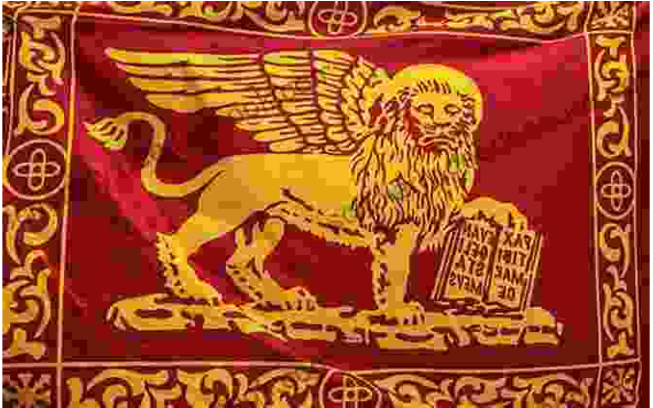
The Lion of St. Mark on the flag of Venice.