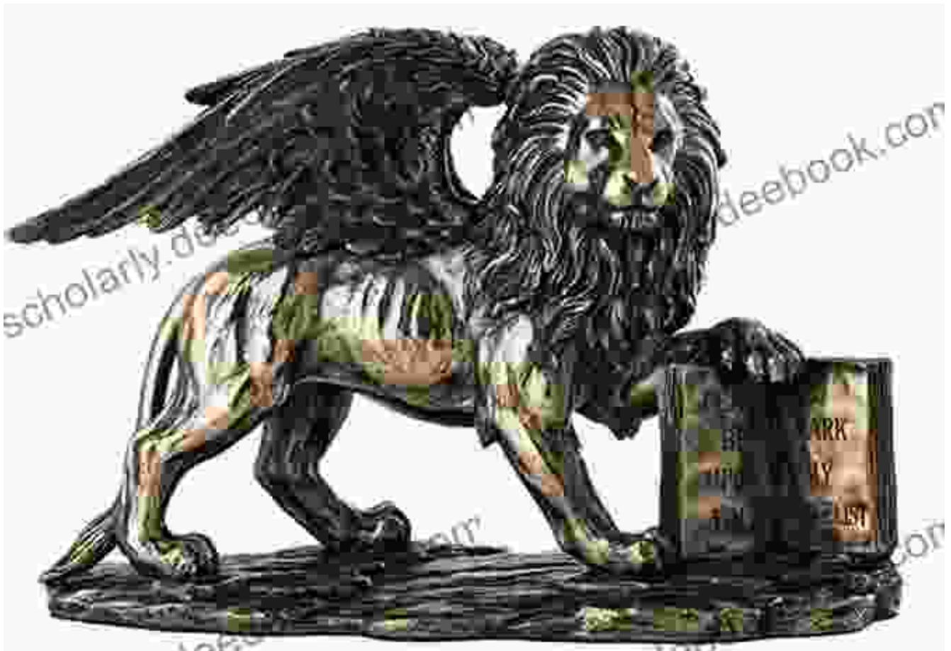
The Lion of St. Mark on a statue in Venice.