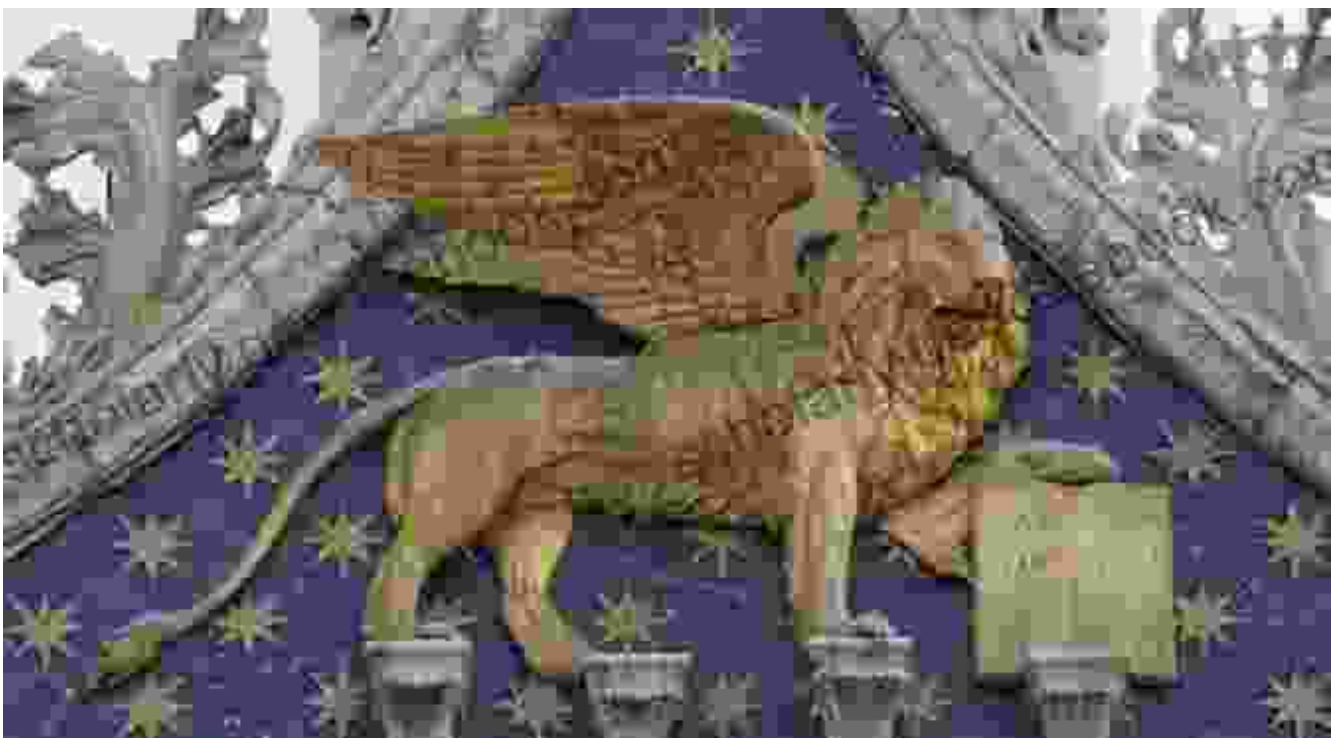
The Lion of St. Mark on the facade of the Basilica di San Marco.